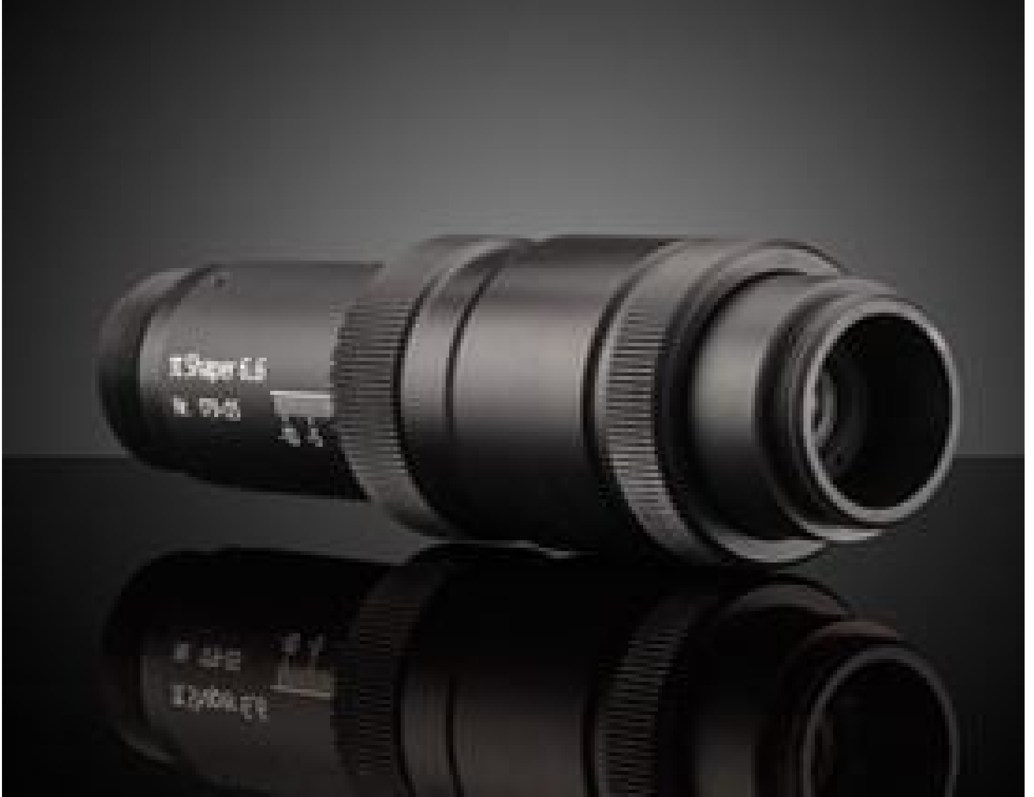
Flat Top Beam Shaper