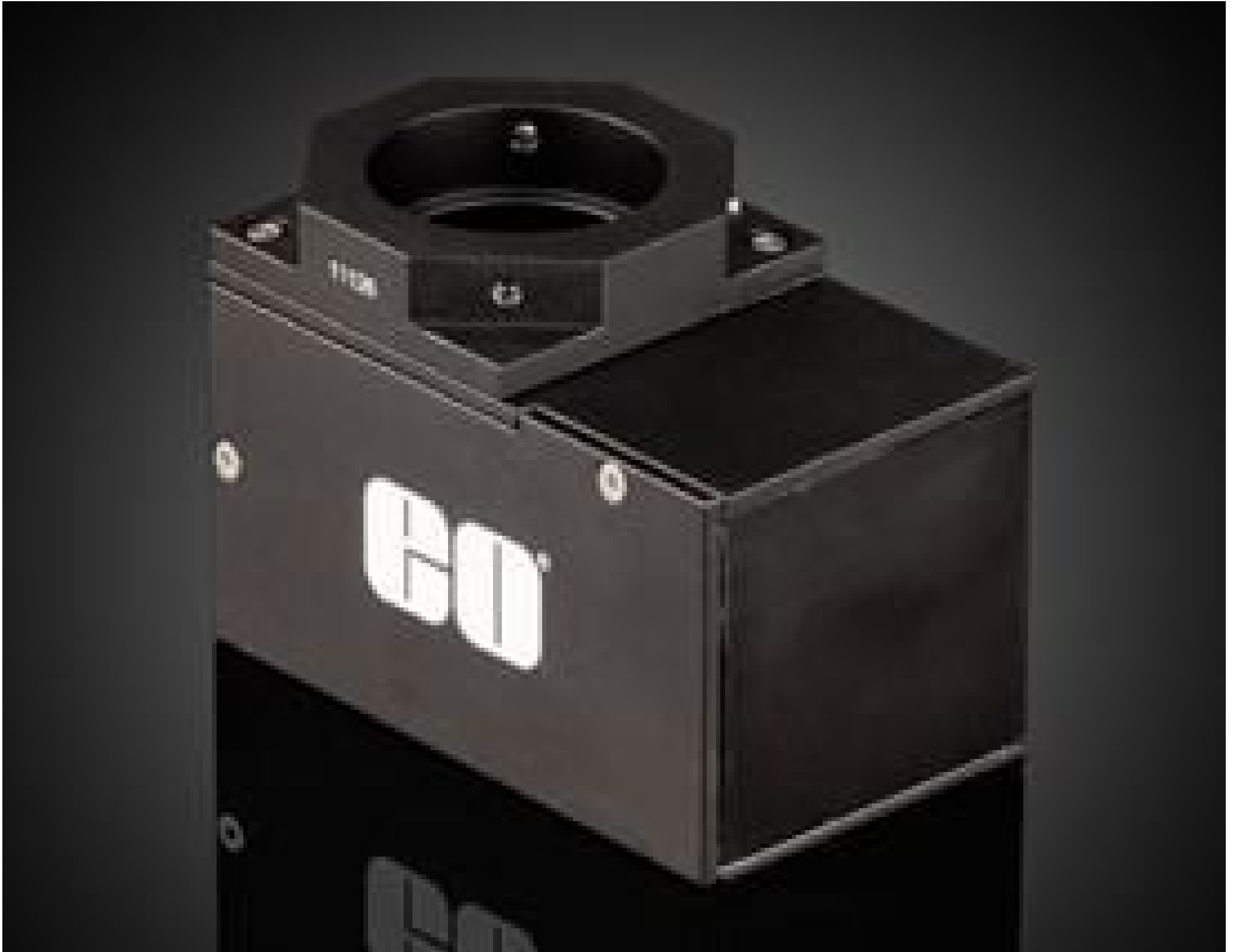
Optical Axis Offset Prism Adapter