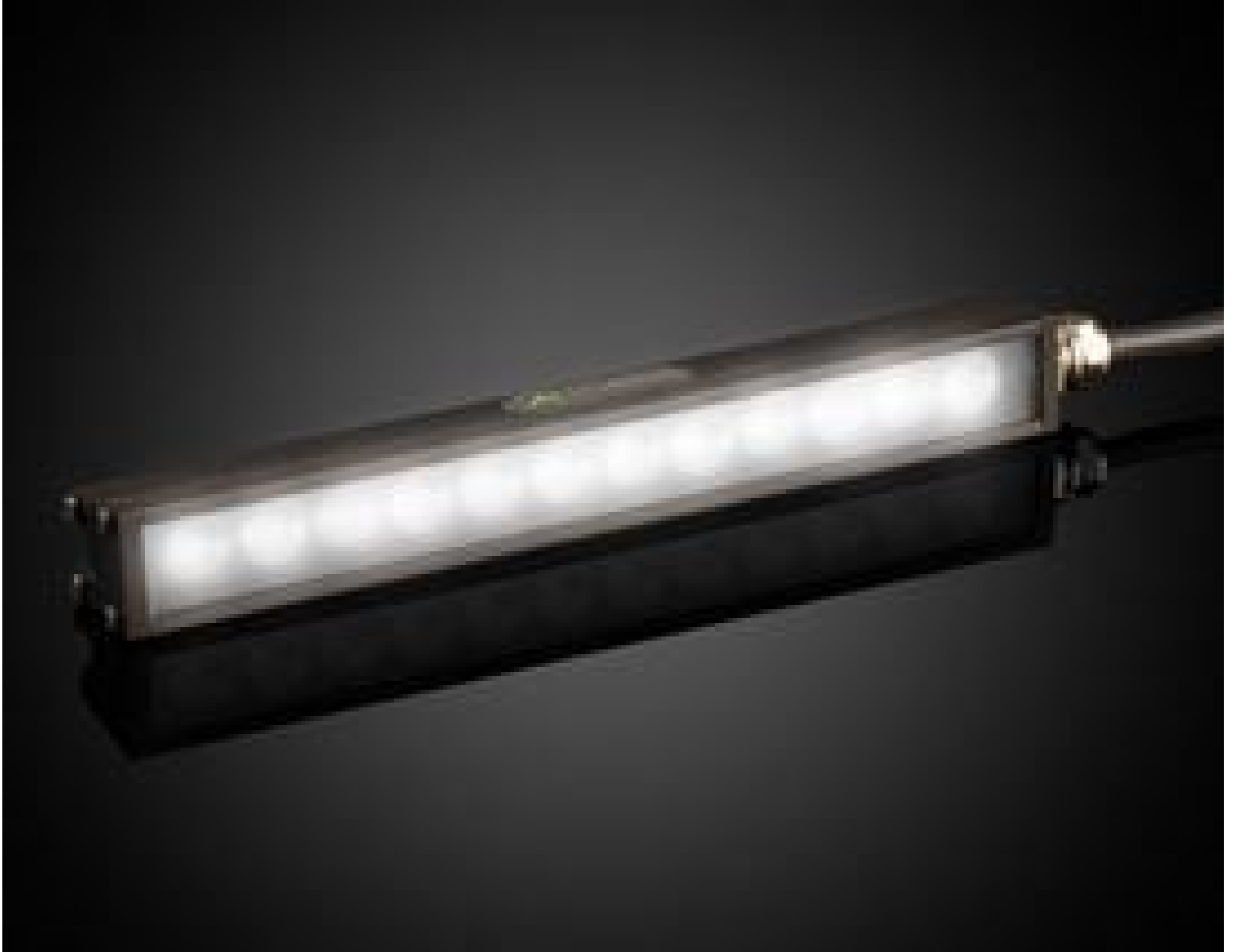
Advanced Illumination MicroBrite Ultra High Intensity Bar Light