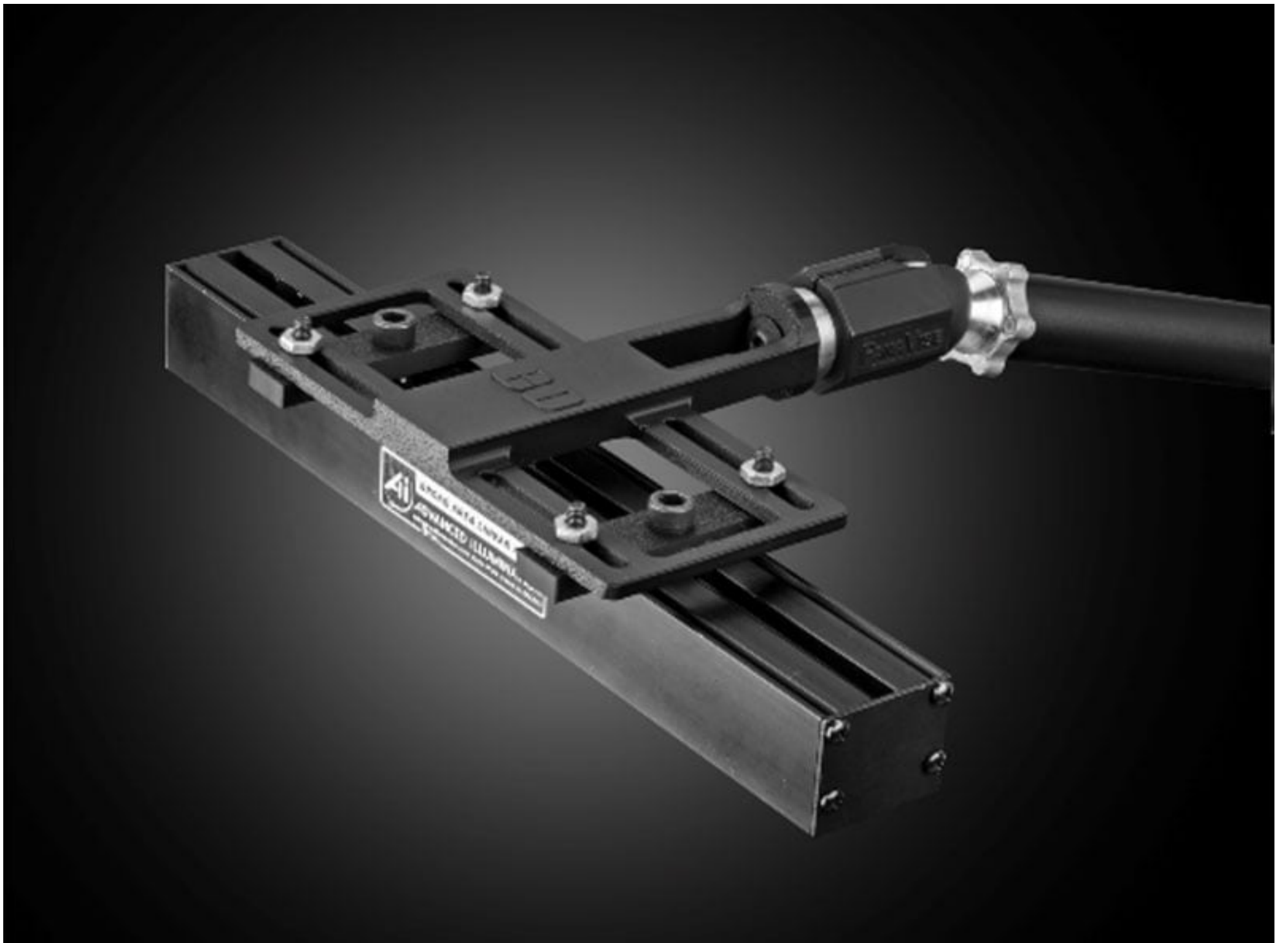
Bar or Line Light Configuration