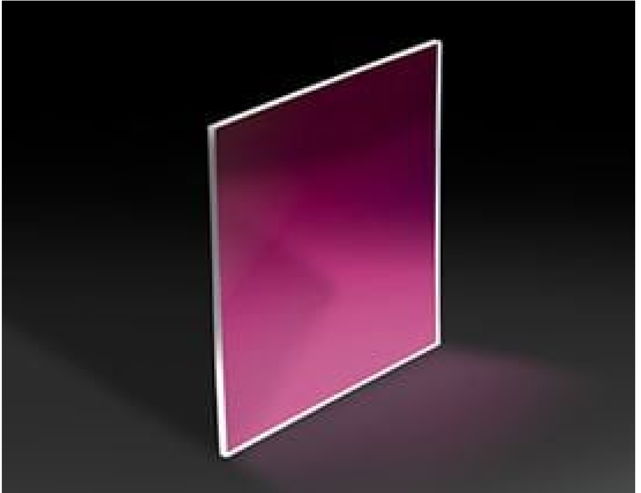
Gorilla® Glass Windows