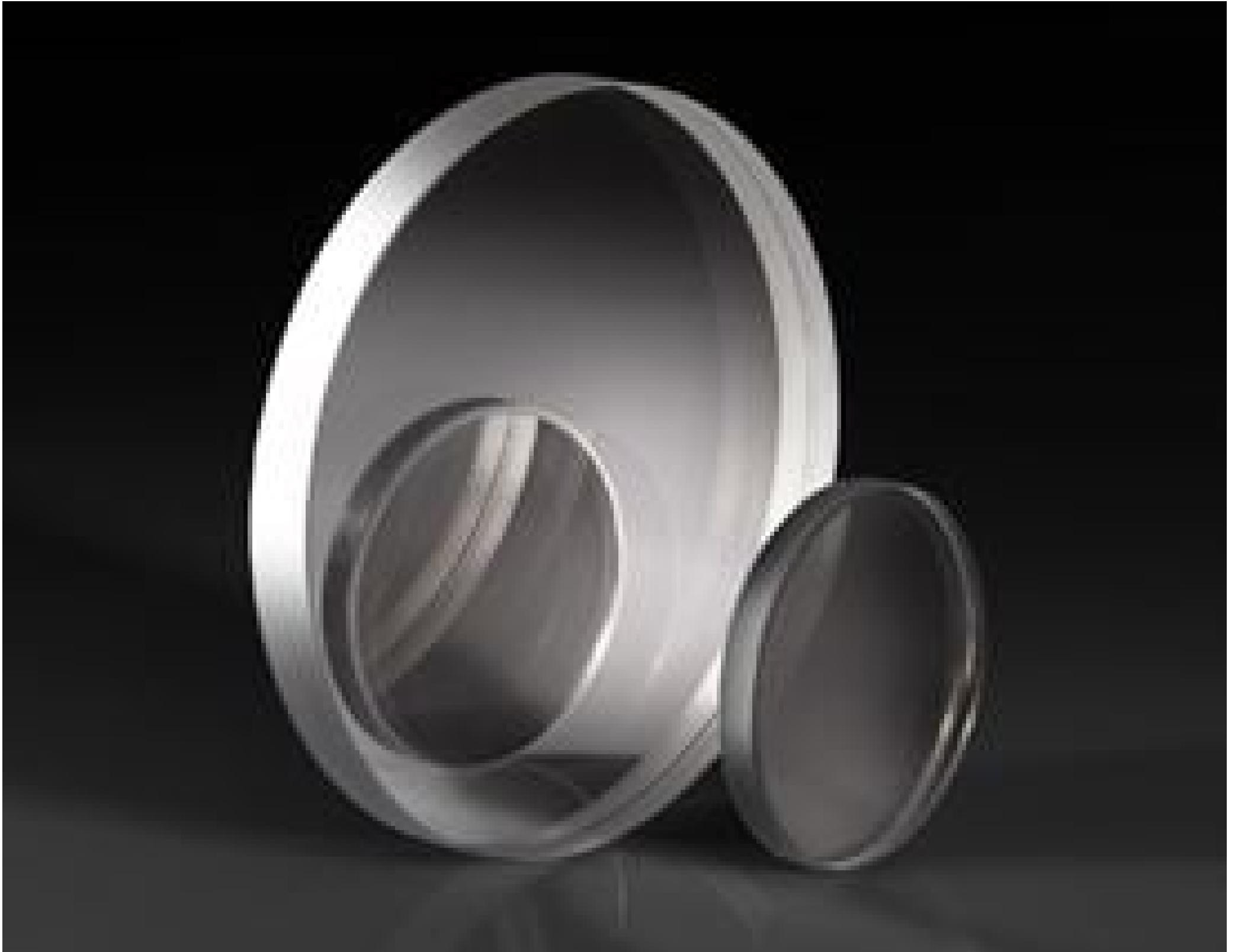
UV-NIR Neutral Density Filters