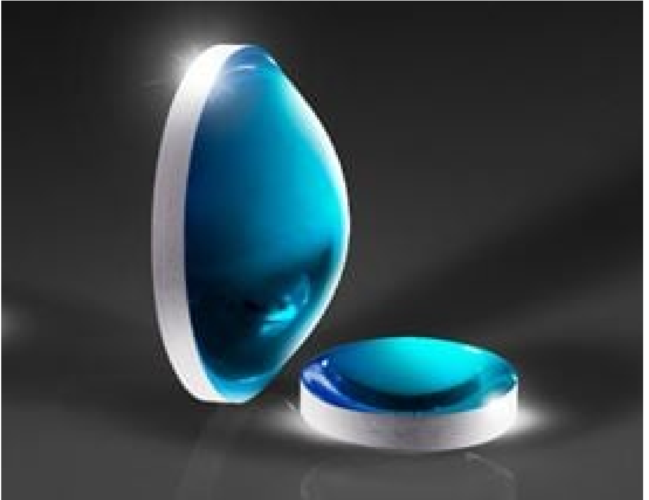
Molded Aspheric Condenser Lenses