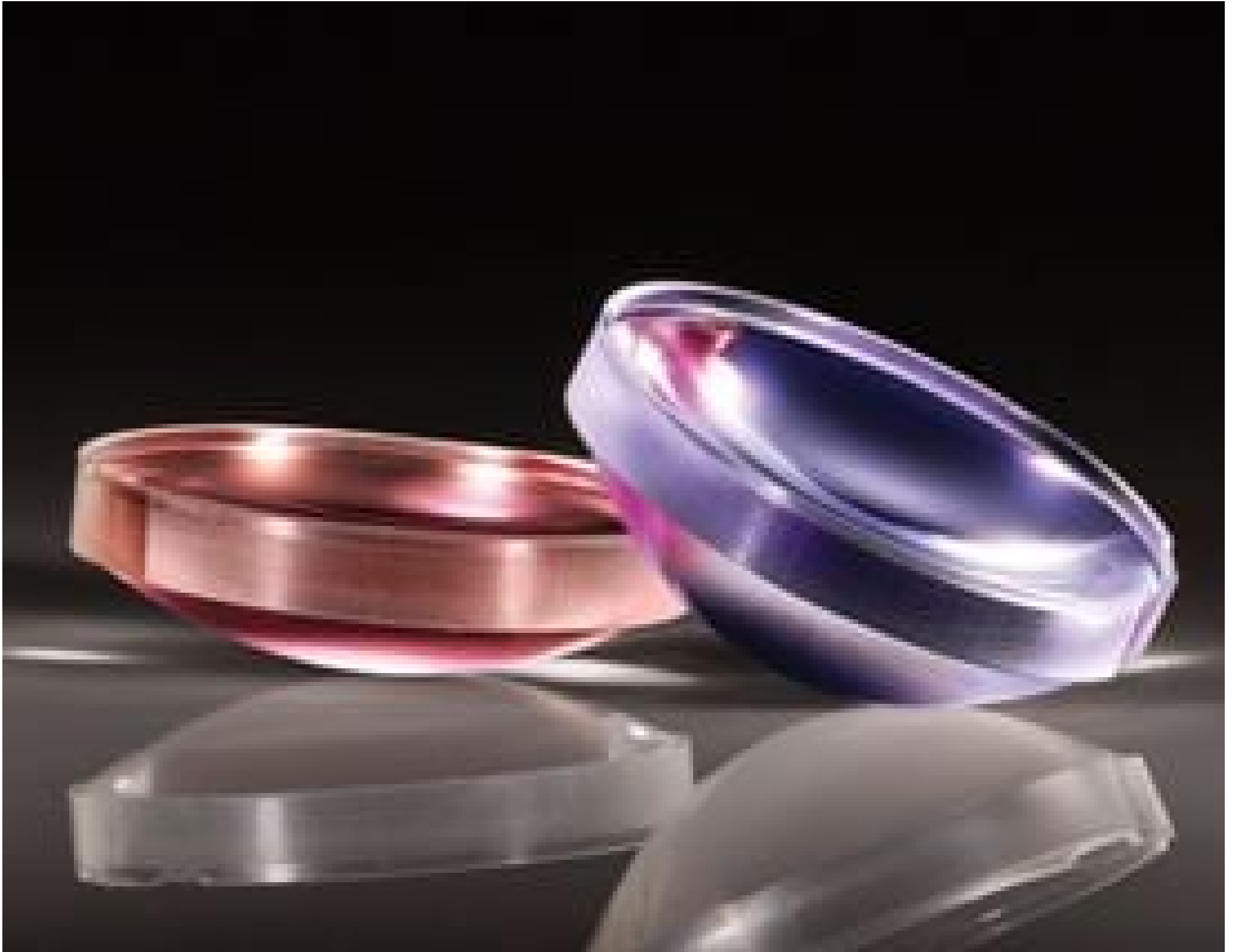
TECHSPEC® Plastic Hybrid Aspheric Lenses