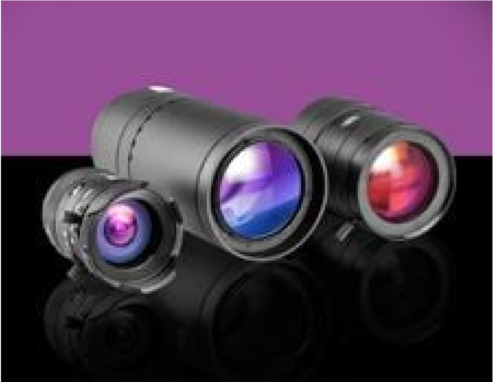
Varifocal Imaging Lenses