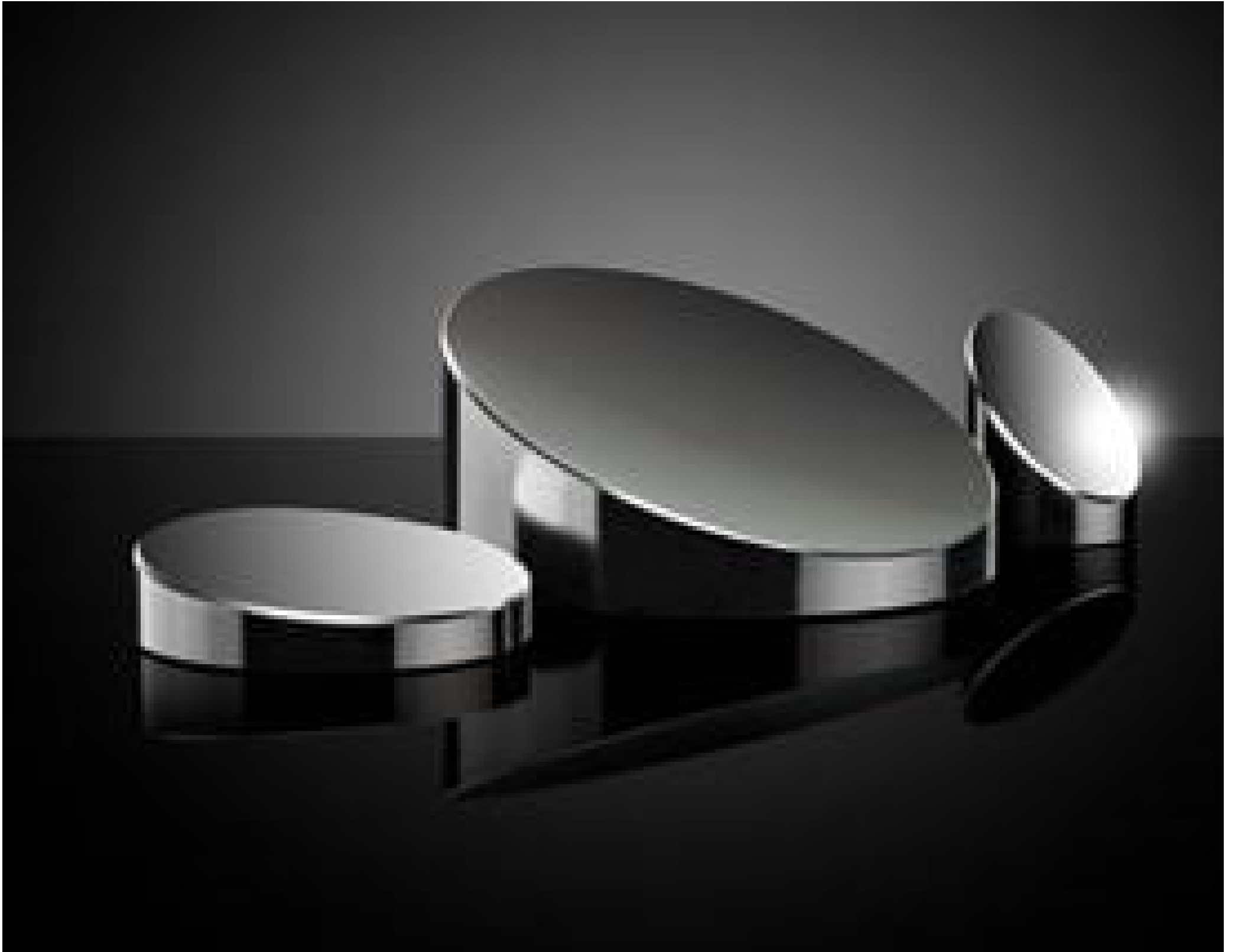
TECHSPEC Aluminum Off-Axis Parabolic Mirrors