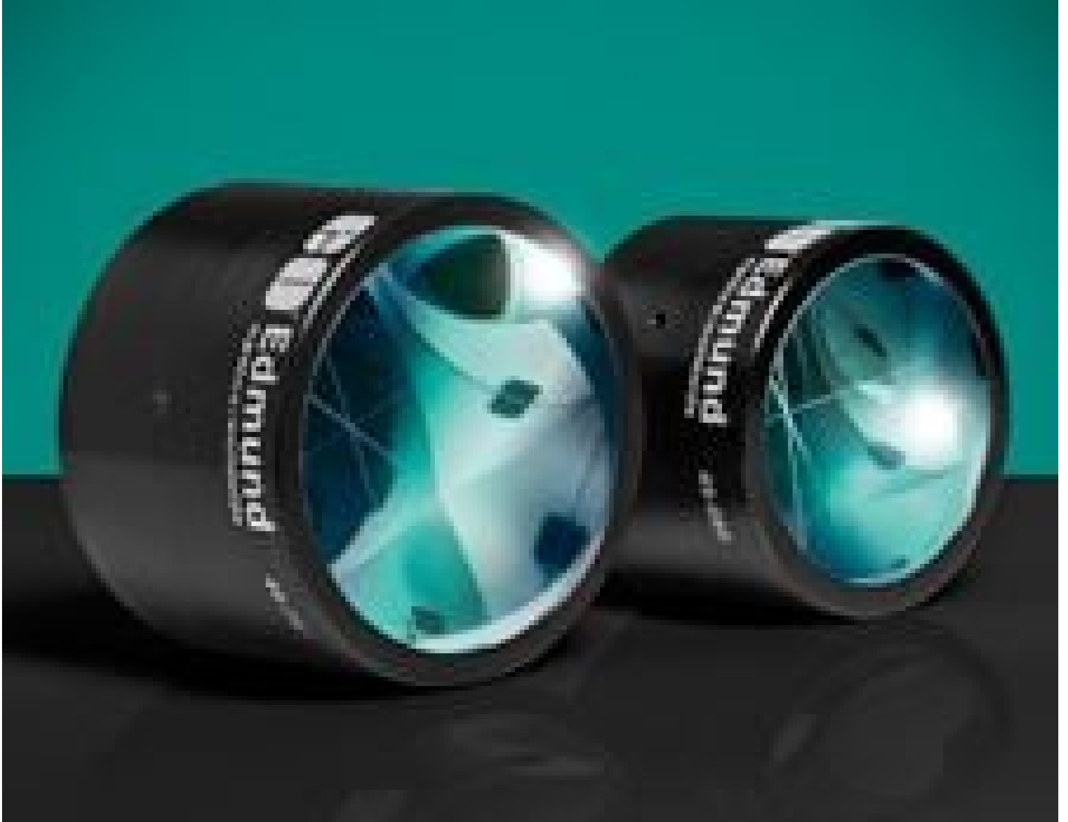
Mounted Fused Silica Corner Cube Retroreflectors