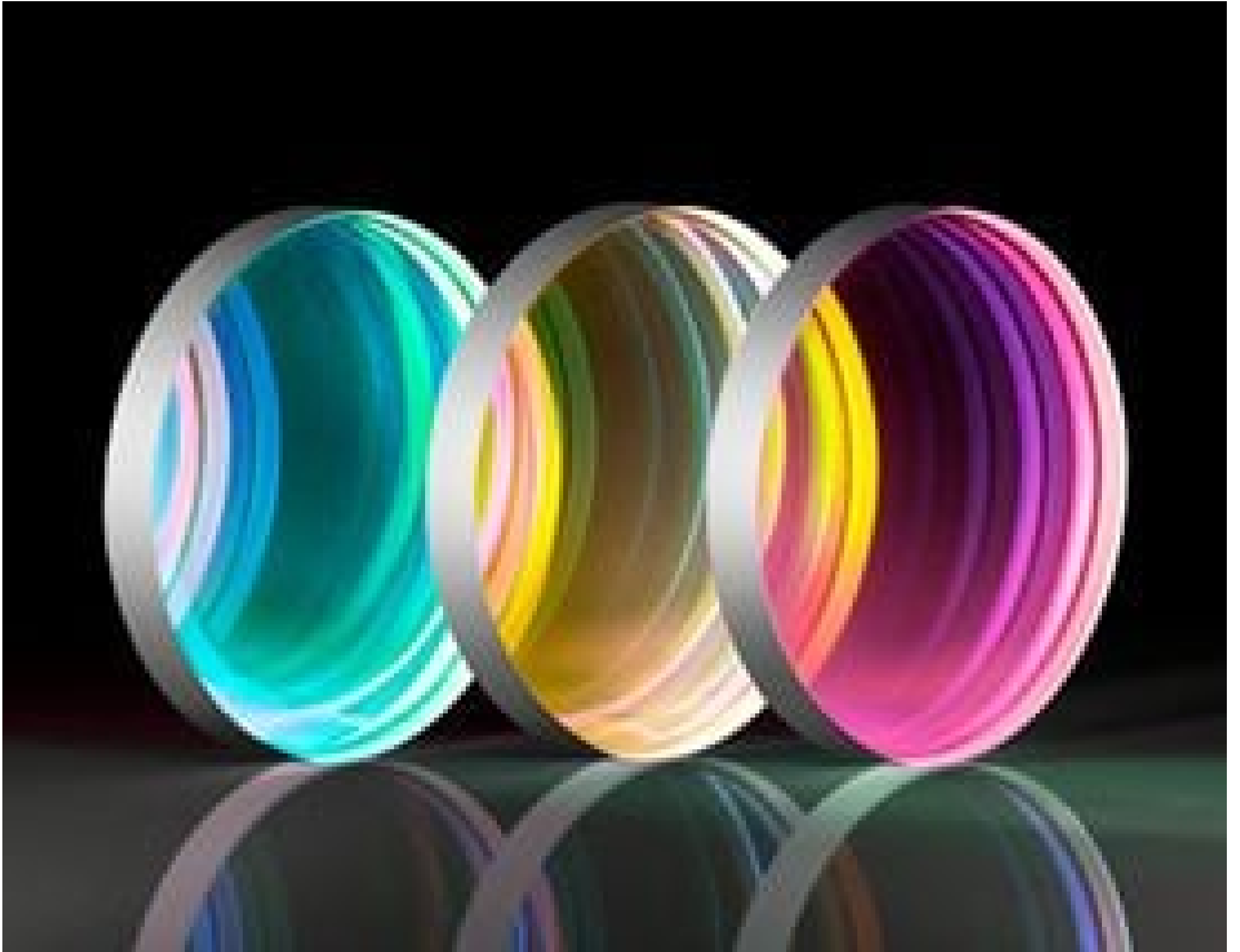
TECHSPEC® Ultrafast Beamsplitters