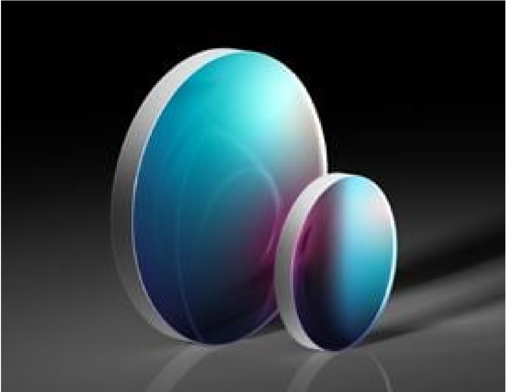
TECHSPEC® Thin Nd:YAG Laser Line Beam Samplers