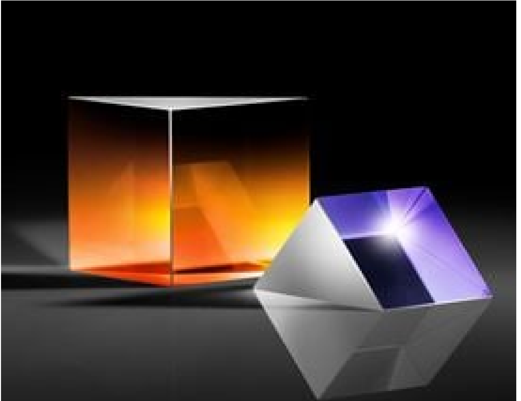
TECHSPEC Nd:YAG Laser Line \lambda/20 UV Fused Silica Right Angle Prisms