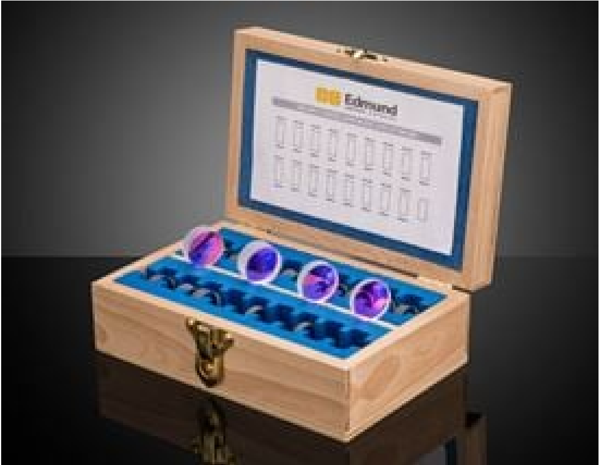
Achromatic Lens Kit