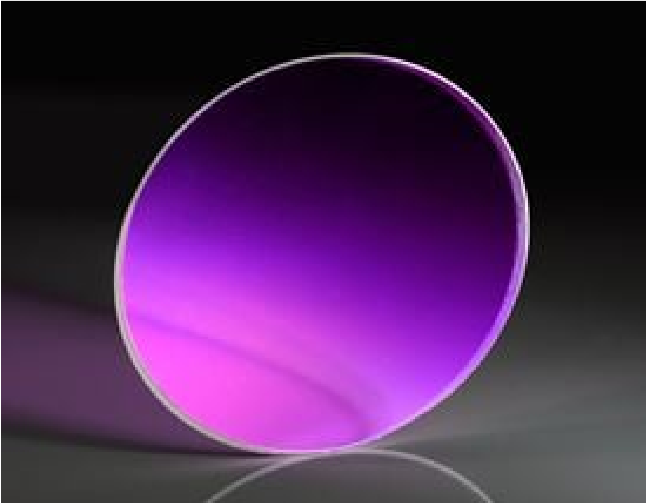
Elliptical Plate Beamsplitters