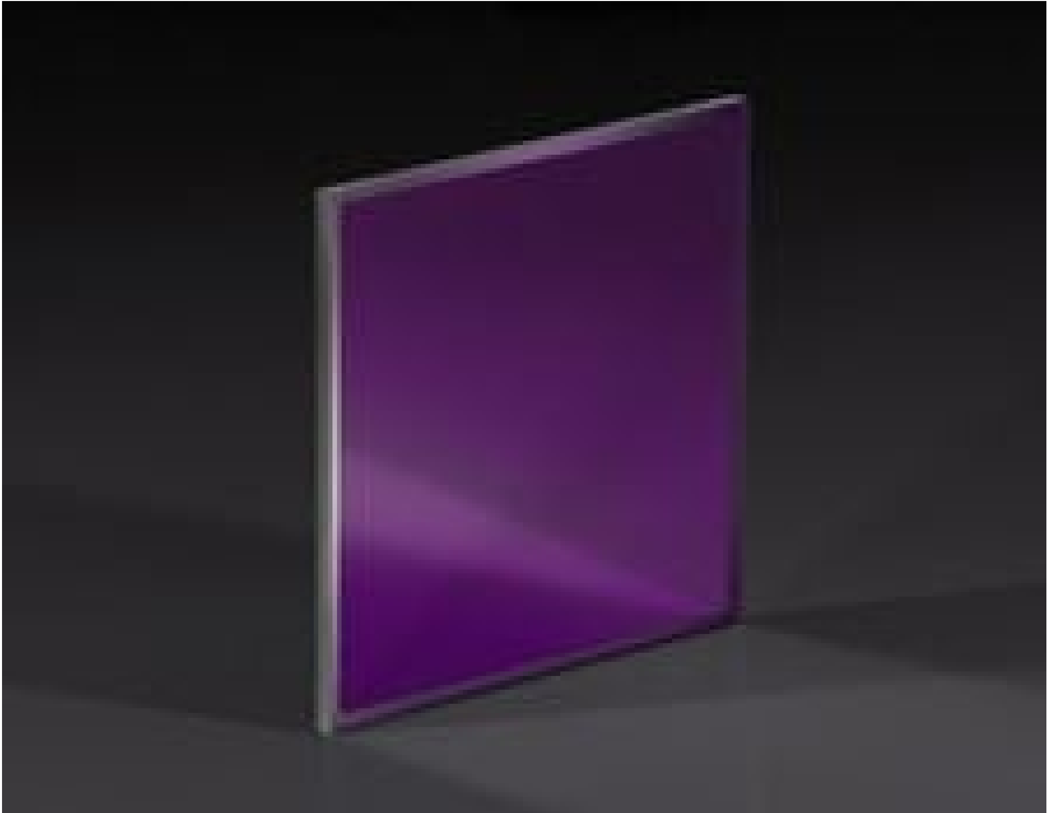
Unmounted Ultra Broadband Wire Grid Linear Polarizer