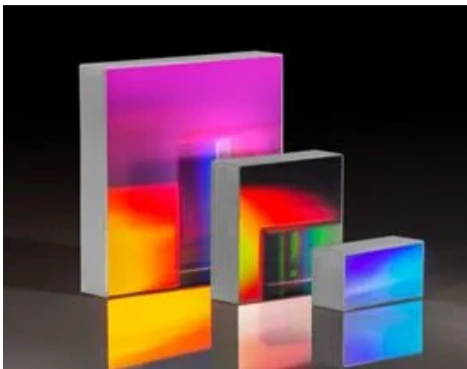
Reflective Ruled Diffraction Gratings