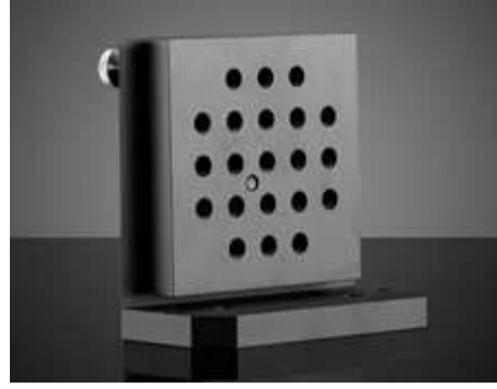
#36-481 - 3.0" Angle Mirror Mount ₹25,223