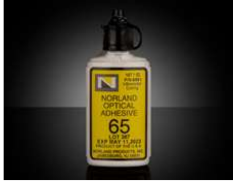
#36-426 - Norland Optical Adhesive NOA 65, 1 oz. Application Bottle ₹4,407