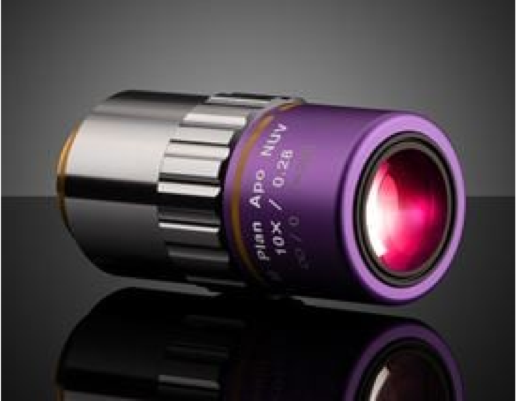
10X Mitutoyo Plan Apo NUV Infinity Corrected Objective, #86-176