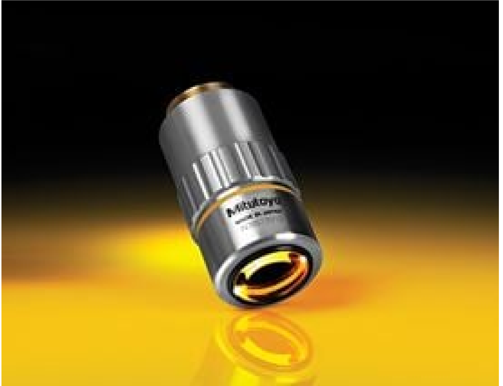
10X Mitutoyo Plan Apo Infinity Corrected Long WD Objective, #46-144