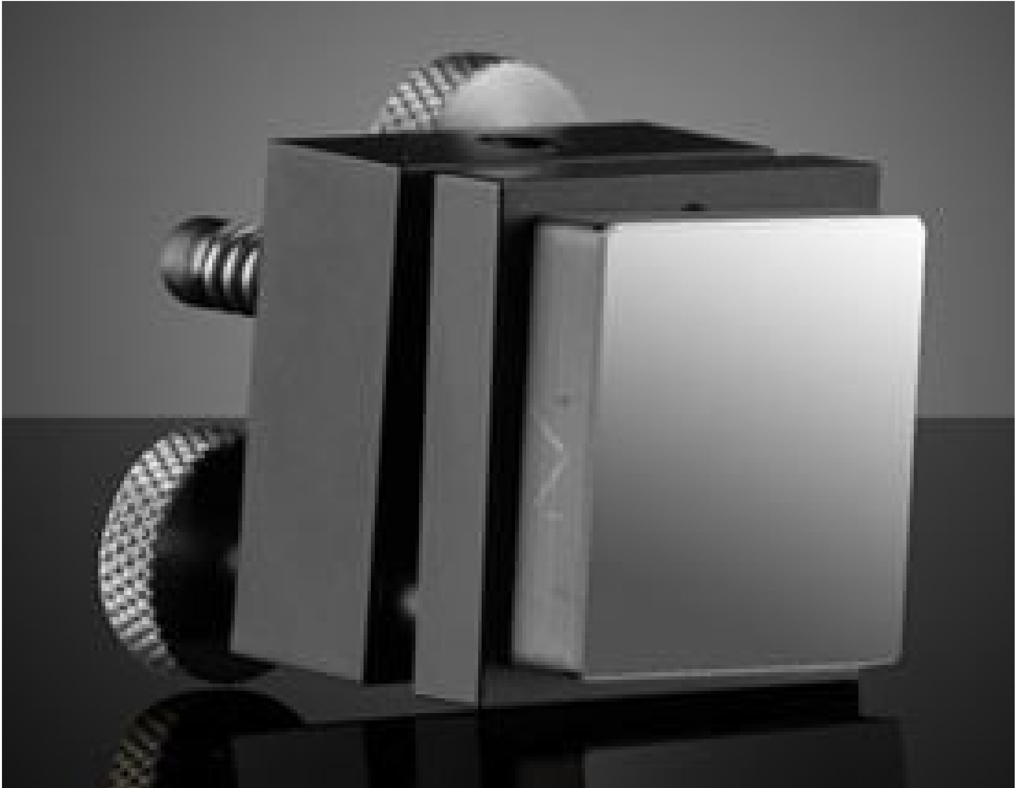
Mirror Mount with Mirror