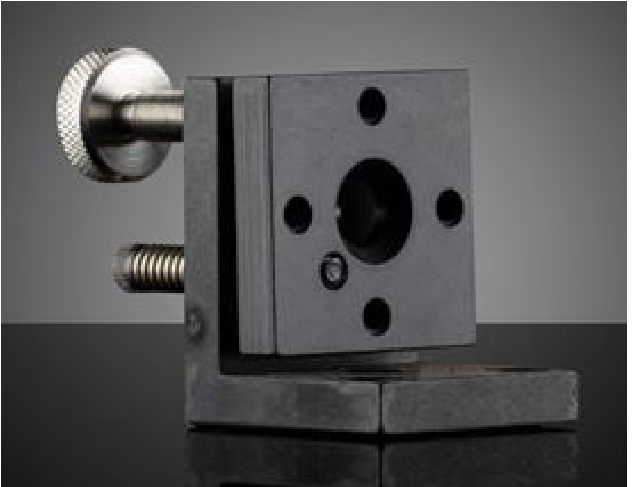
1.0" Angle Mirror Mount