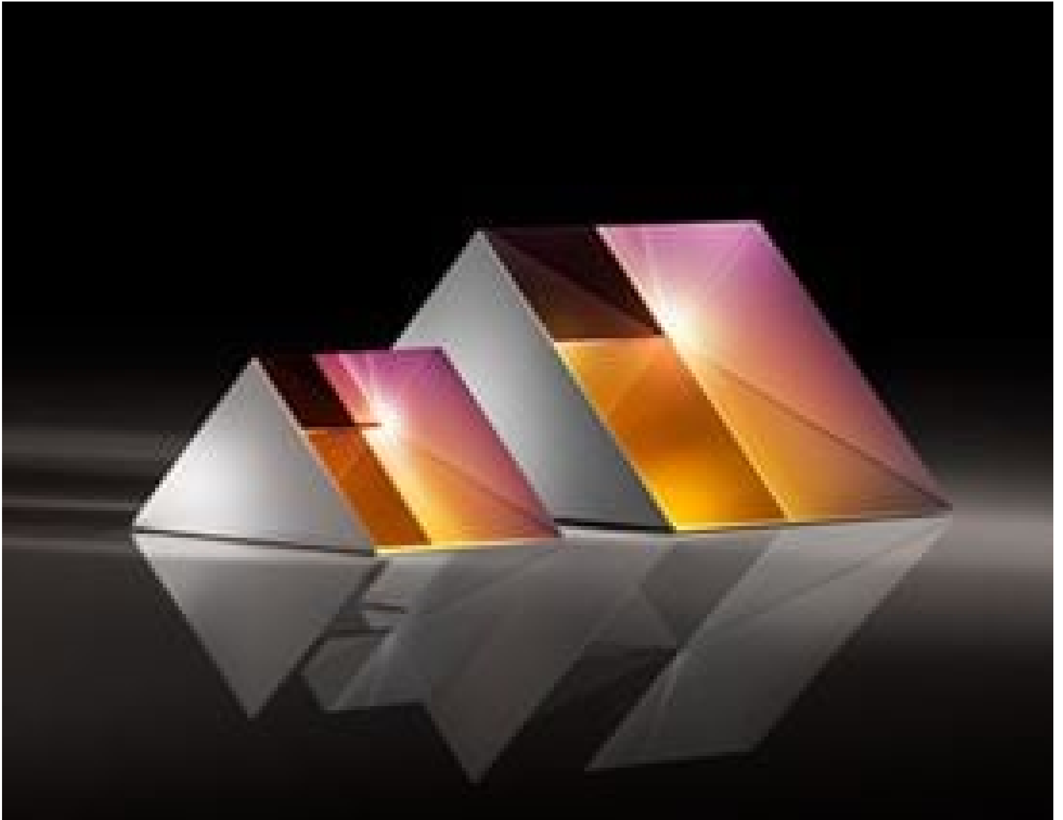
TECHSPEC UV Fused Silica Right Angle Prisms