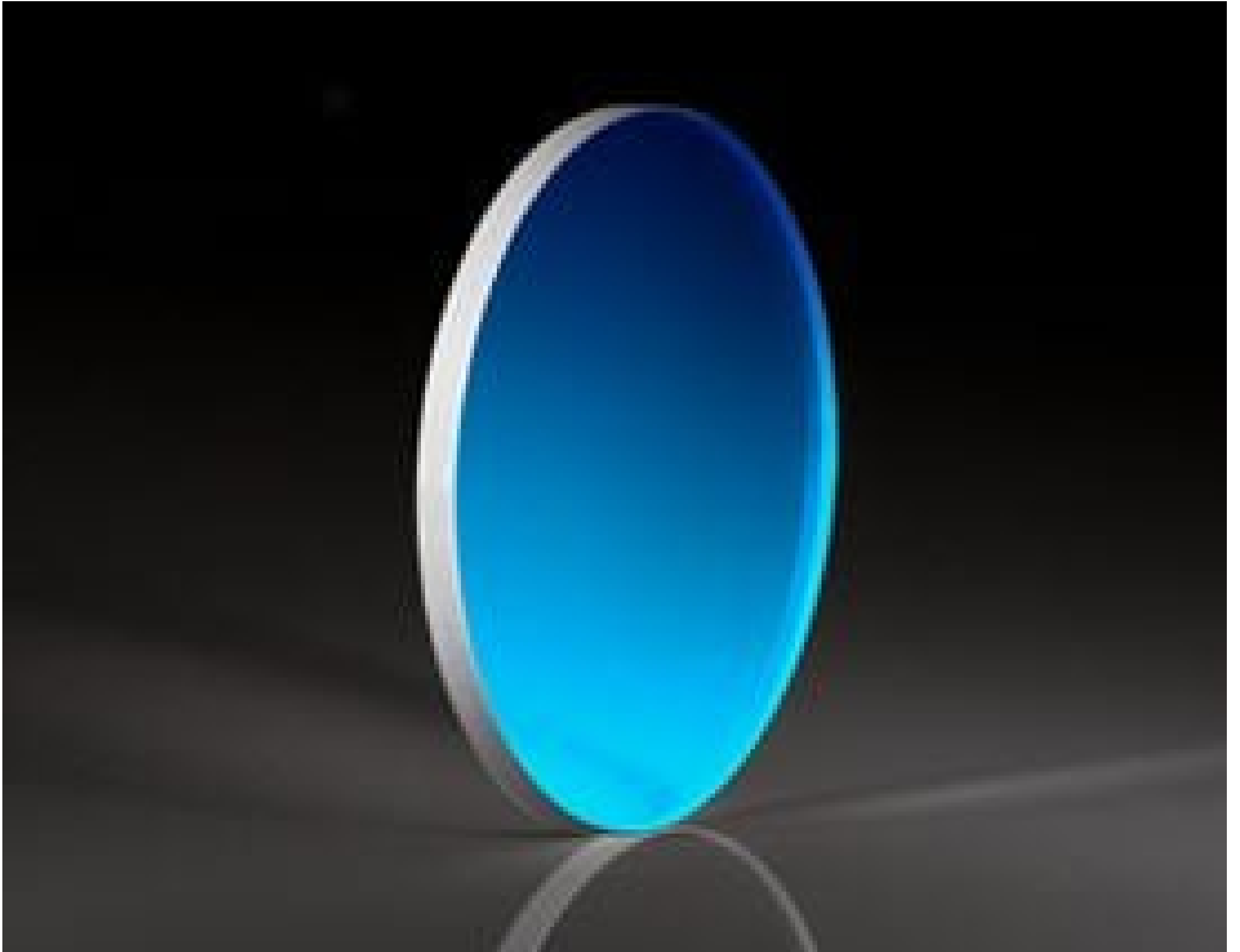
Uncoated \lambda/20 Fused Silica Window