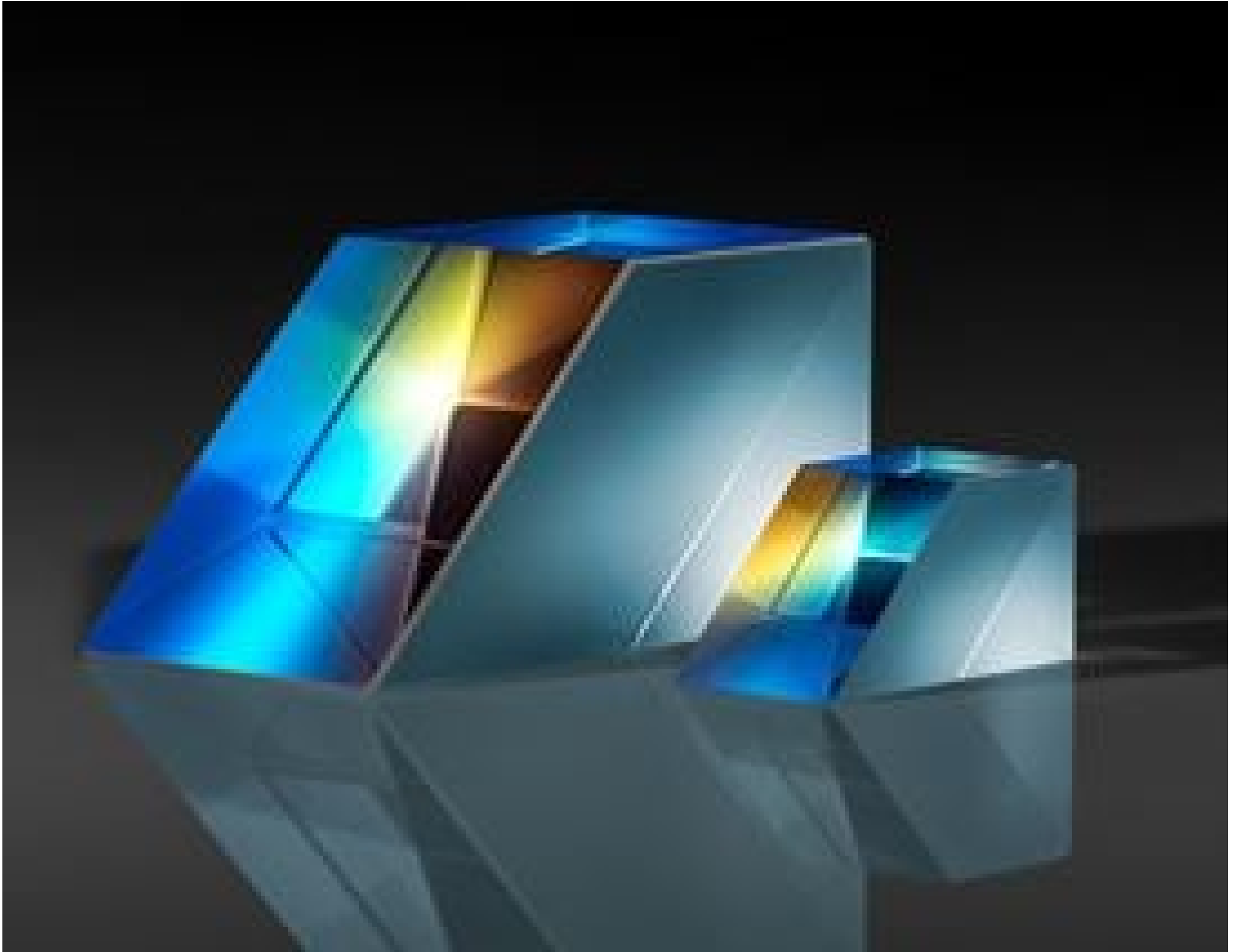
Lateral Displacement Beamsplitters