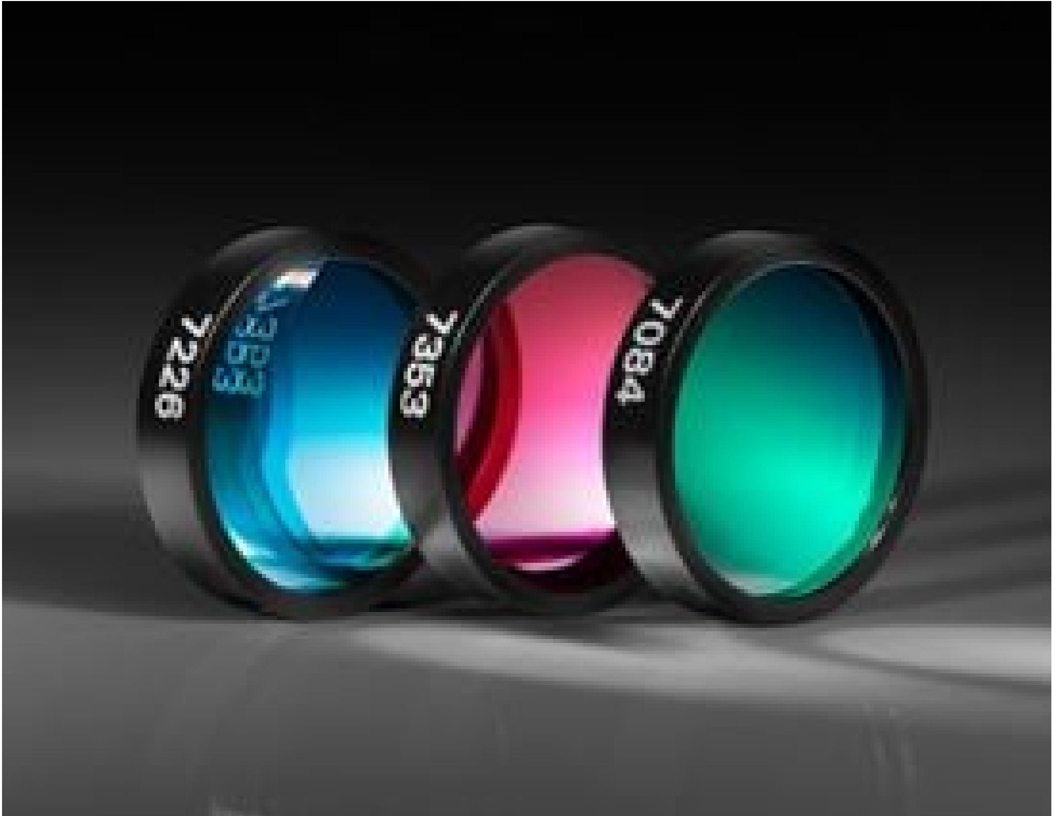
Ultra Narrow Bandpass Filters