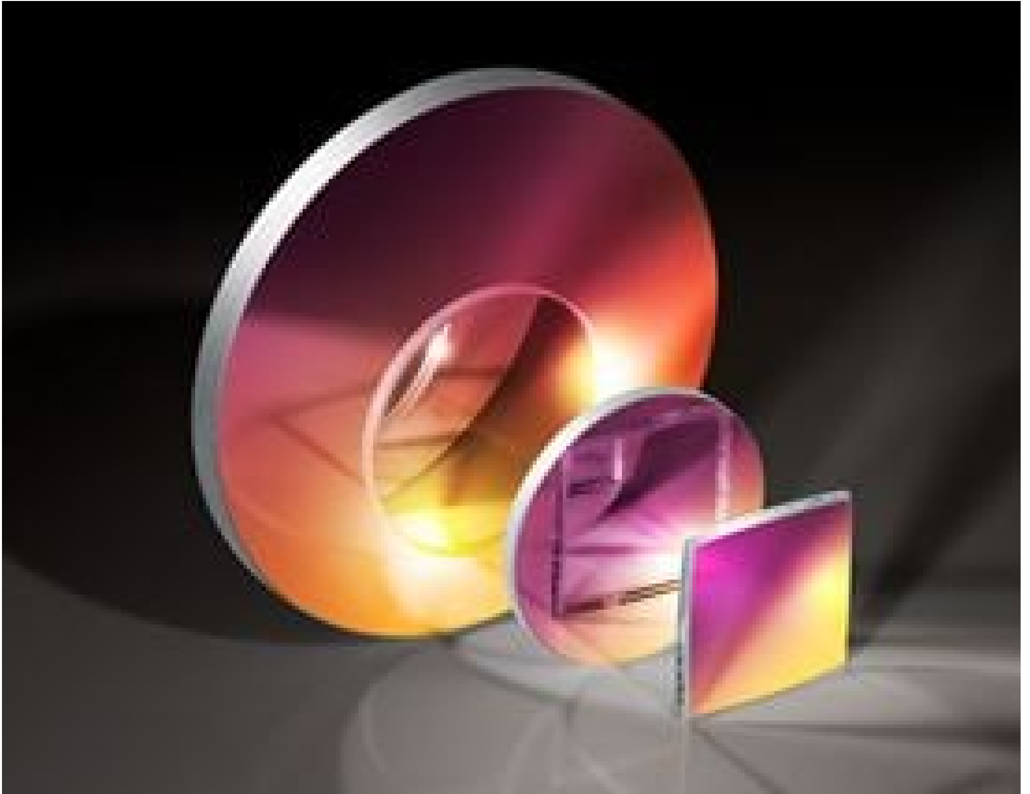
4-6λ First Surface Mirrors