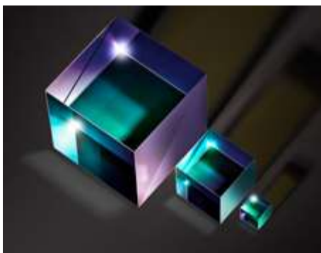
#32-505 - 25mm 50R/50T Cube Beamsplitter ₹28,047