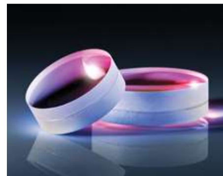
#32-303 - 6.25mm Dia. x 20mm FL, MgF 2 Coated, Achromatic Doublet Lens ₹7,164