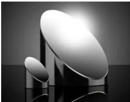
Silver Off-Axis Parabolic Mirrors