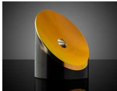
Off-Axis Parabolic Mirrors with Alignment Through Holes