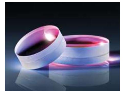
#32-323 - 25mm Dia. x 50mm FL, MgF 2 Coated, Achromatic Doublet Lens ₹12,309