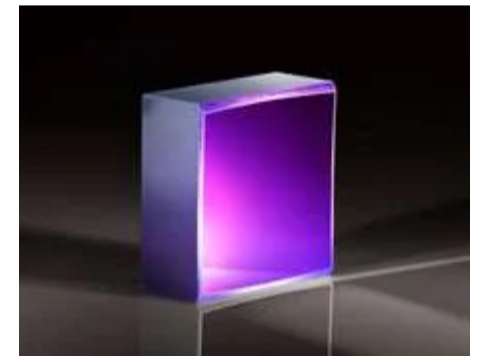
High Performance Off-Axis Parabolic Mirrors