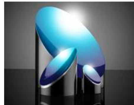
Ultrafast-Enhanced Silver Coated Off-Axis Parabolic (OAP) Mirrors