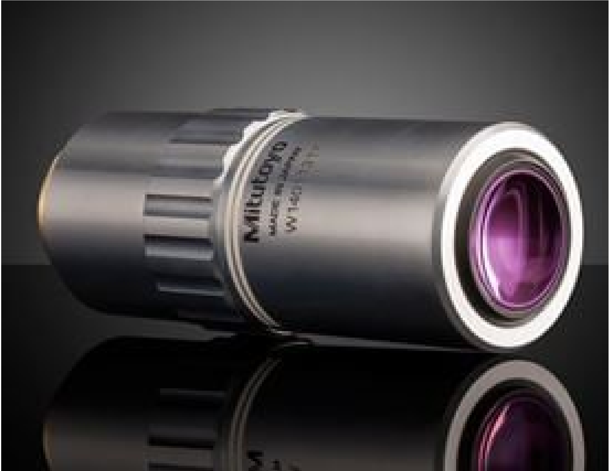
100X Mitutoyo Plan Apo SL Infinity Corrected Objective, #46-401