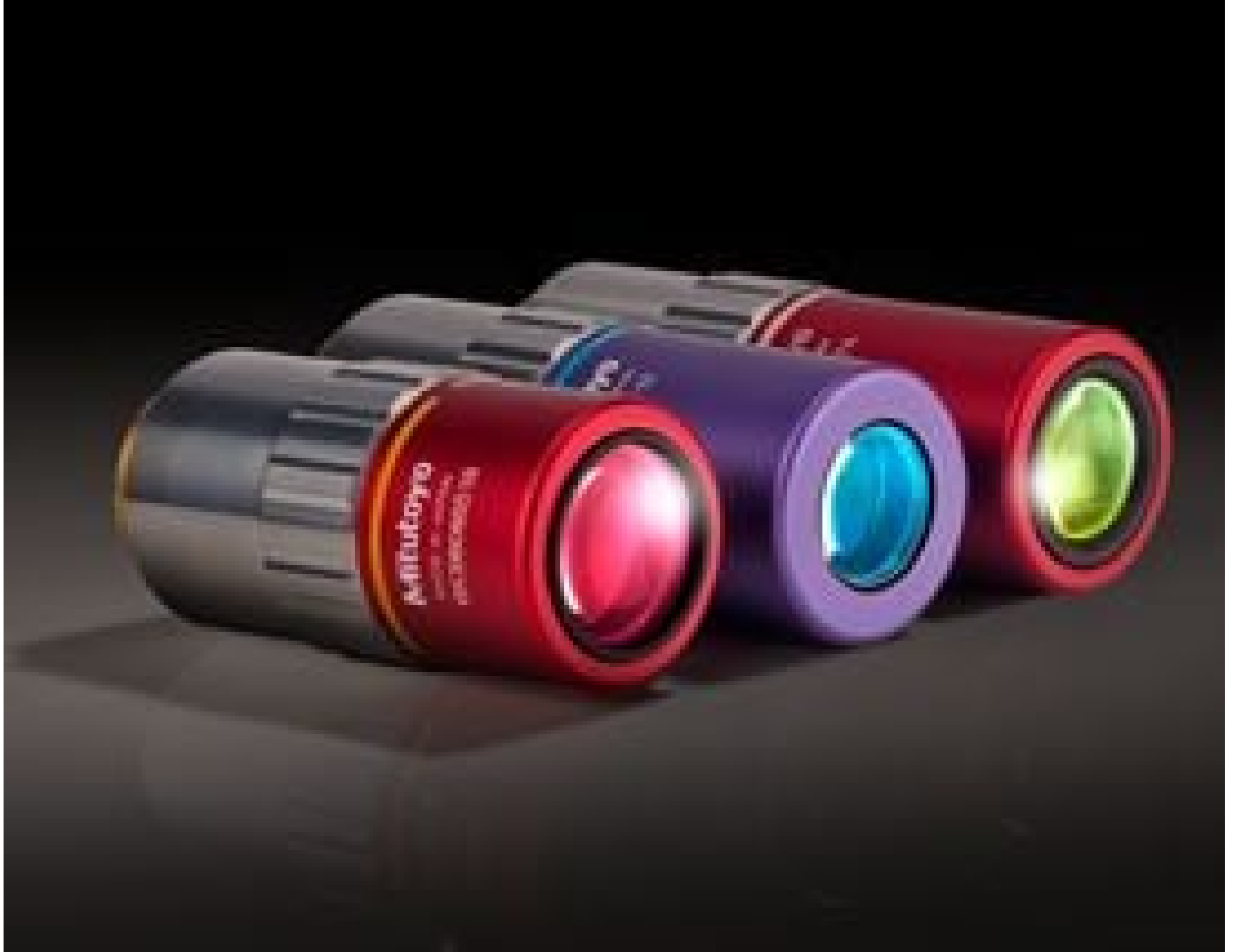
Mitutoyo NIR, NUV, and UV Infinity Corrected Objectives