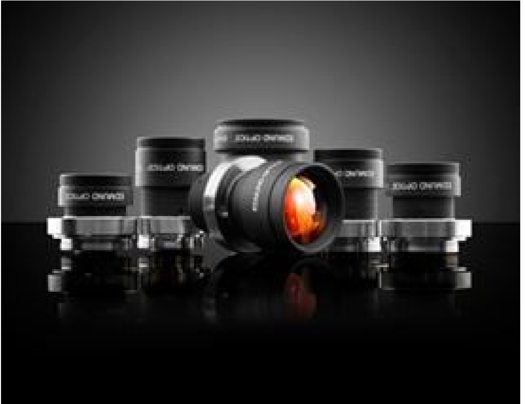
TECHSPEC® Cr Series Fixed Focal Length Lenses