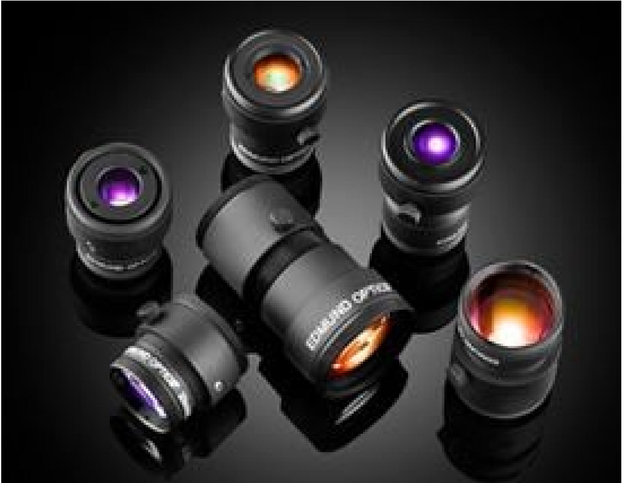
TECHSPEC® Ci Series Fixed Focal Length Lenses