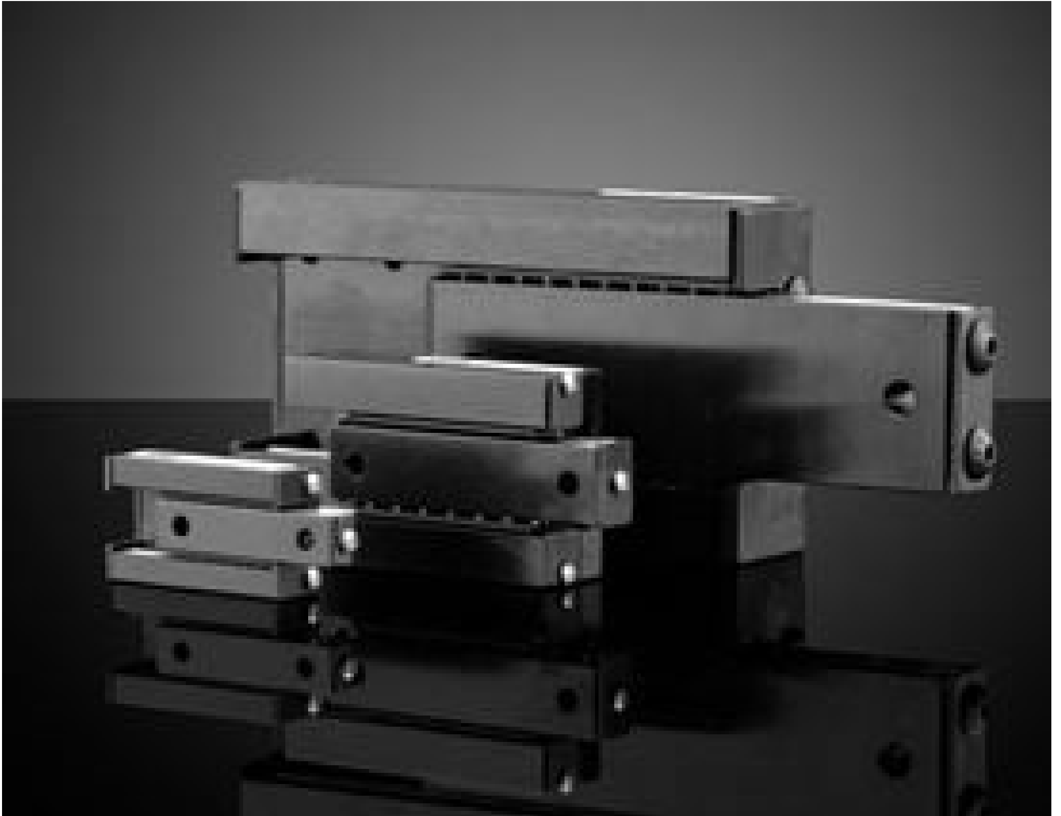
Linear Motion Ball Bearing Slides