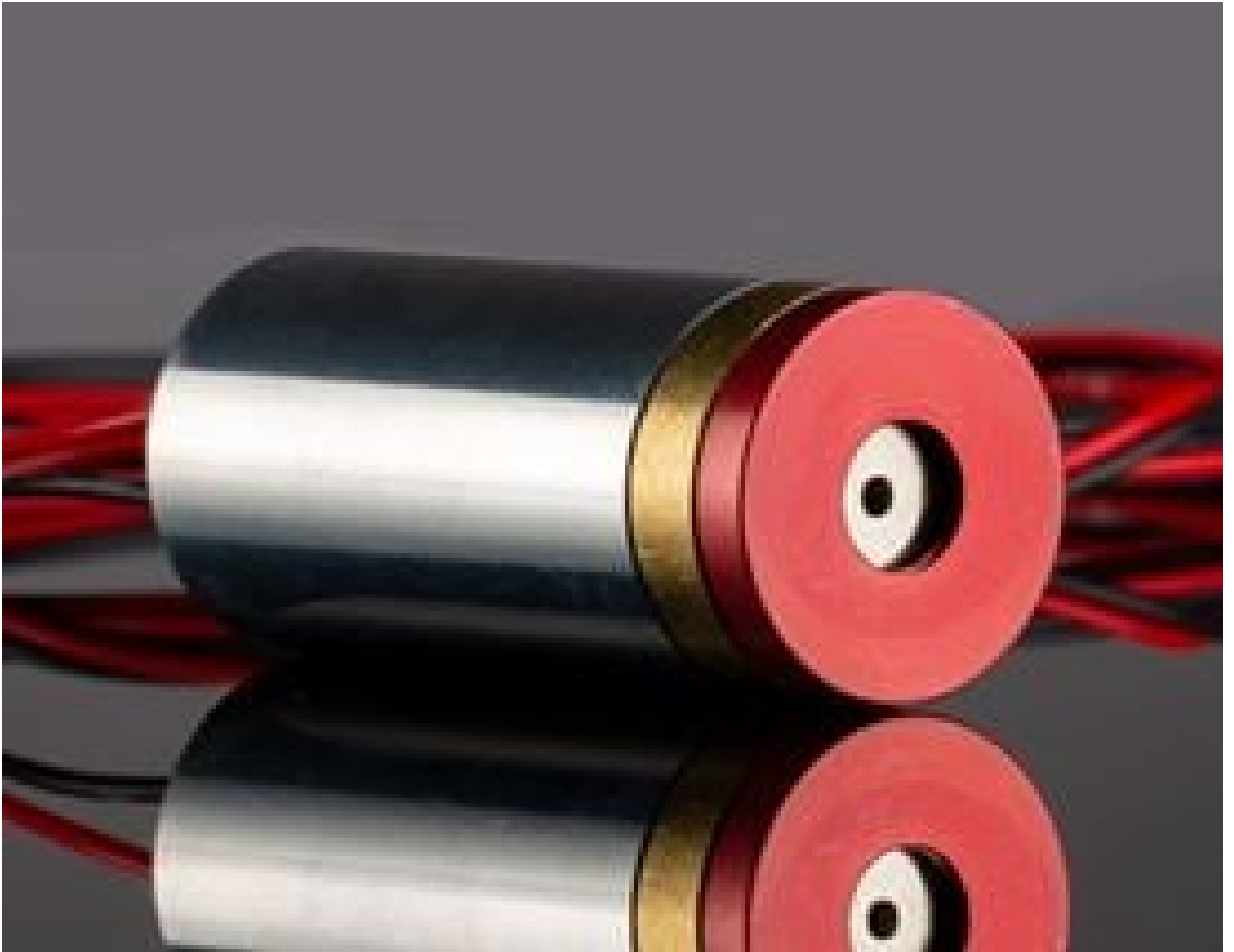
Coherent® VHK™ Circular Beam Visible Laser Diode