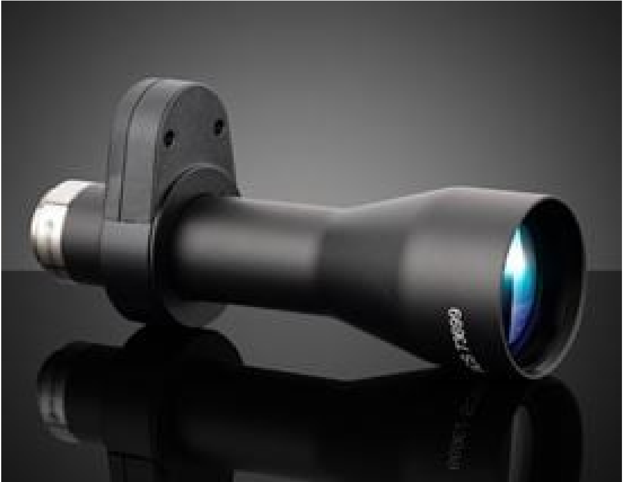
0.25X MercuryTL™ Liquid Lens Telecentric Lens