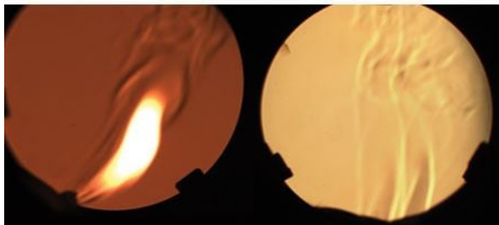
Flame Analysis using 6" Schlieren System