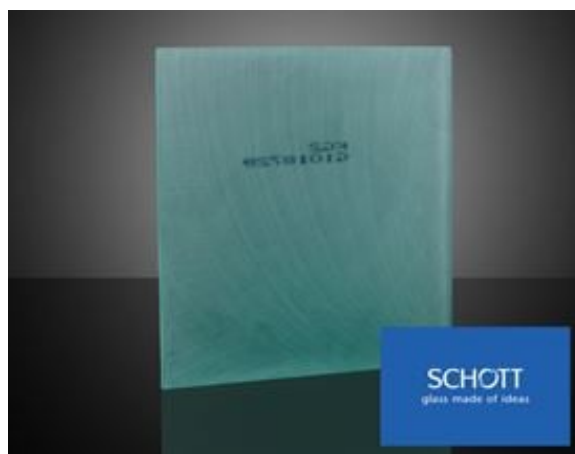
SCHOTT KG Glass (glass color will vary by product specification)

SCHOTT Matte Colored Glass Filter Plates are unpolished plates of colored glass that are used as raw material to manufacture SCHOTT Colored Glass Filters . With large standard sizes up to 165 x 165mm, these plates can be cut, ground, and polished to meet application requirements for a wide range of filter sizes. SCHOTT Matte Colored Glass Filter Plates are available in all SCHOTT colored glass types including shortpass (heat absorbing), longpass, bandpass, and neutral density. To learn more about how our custom optical colored glass filter capabilities can be used for your application, see our capabilities page .